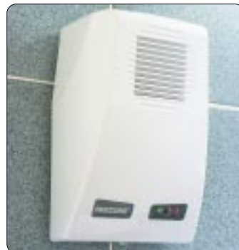
Permanent fixed installation